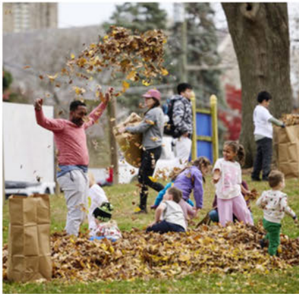
Love Your Park Fall at Gorgas Park