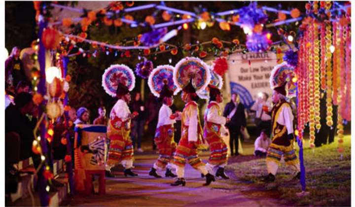
Gran Fiesta de los Muertos