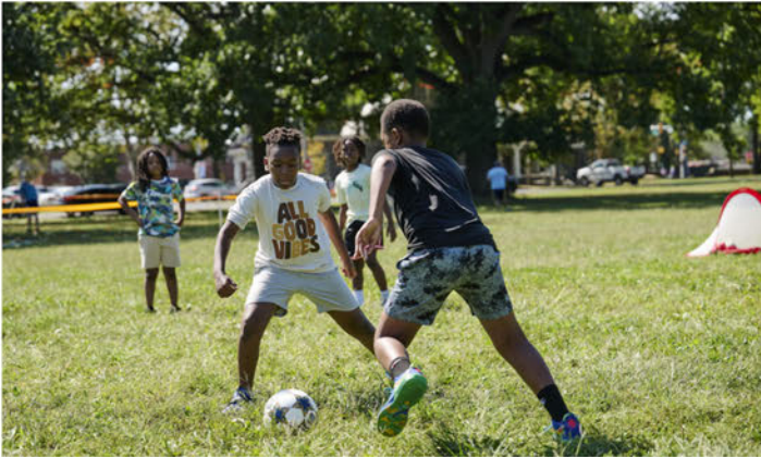
West Park Family Field Day

In total, over 8,700 people attended the 81 program events that the Conservancy organized. Sixty percent of programs were completely free, and 70% of our program partners were minority and women-owned businesses.