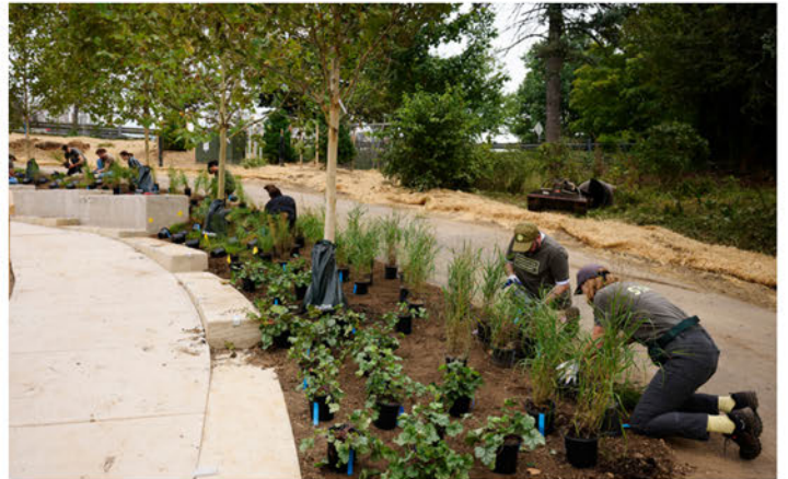
Community planting at Johnny Sample Recreation Center