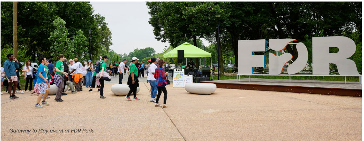
Gateway to Play event at FDR Park

As we embark on a new chapter, we remain committed to the programs, projects, and commitments at the heart of our mission to steward our parks and nurture our shared environment, cultural resources, and public health.