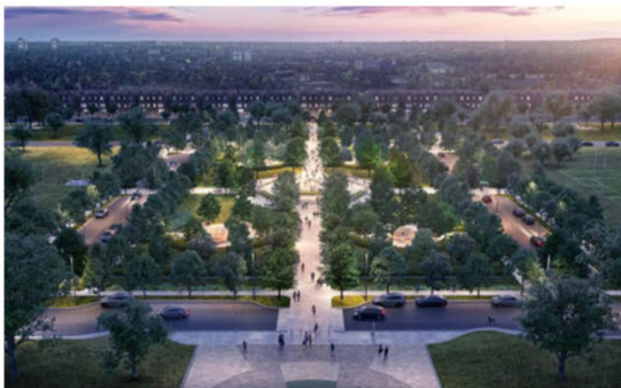
John Welsh Memorial Fountain rendering

Also in West Fairmount Park, the Conservancy worked with Philadelphia Parks & Recreation and the Belmont Plateau Trails Alliance to perform critical maintenance on the Trolley Trail. This work included removing invasive plants from the path, re-positioning and adding trail blazes, and repairing several wooden bridges.