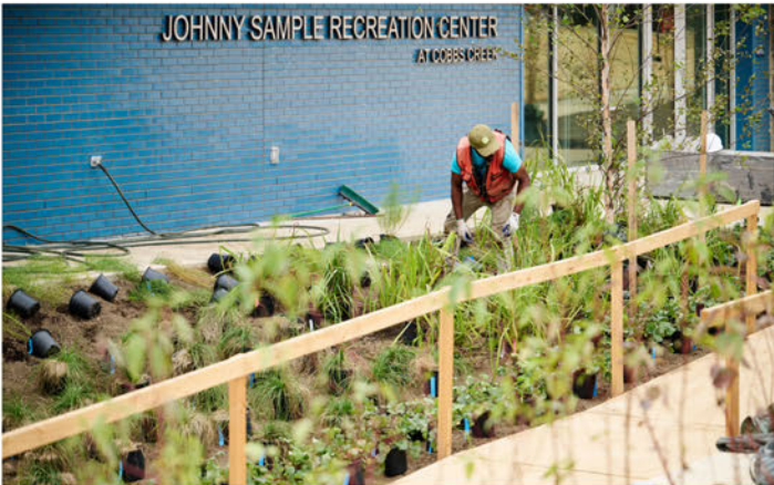
Community planting at Johnny Sample Recreation Center

The project also included landscape upgrades based on community feedback. In September, the Conservancy and Rebuild led a community-supported effort to plant 2,000 native grasses and flowers throughout the recreation center grounds. This project drew on the expertise and efforts of our Capital Projects, Land Care, and Volunteer Program teams, who worked together to mobilize volunteers, enhance green spaces, and create a welcoming place for neighbors of all ages to gather, play, and connect.