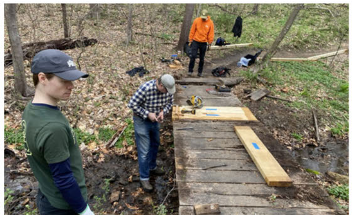
Trolley Trail bridge repair