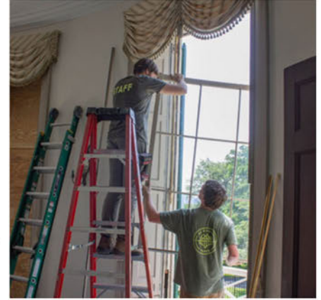
Lemon Hill Mansion window restoration

The Conservation team also shared their expertise with the public in multiple forums over the last year, leading workshops for homeowners in Strawberry Mansion and Parkside and hosting a tour of Ohio House's award-winning restoration for members of the Preservation Alliance of Greater Philadelphia.