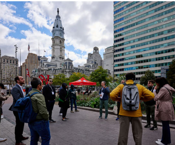
Civic Commons Studio Walking Tours