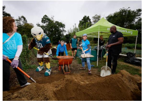
Braskem & Philadelphia Eagles Volunteer Workday

Our Volunteer Program brings volunteer opportunities to individuals, groups, and organizations in support of West and East Fairmount Park, Cobbs Creek Park, FDR Park and other parks within the Park Friends Network. Through the Volunteer Program, 1,587 volunteer participants joined the Conservancy across 79 volunteer events, totaling 4,250 volunteer hours in 2024. Volunteers helped remove invasive species, pick up trash, tend trees, maintain trails, and more. The total impact from these committed volunteers included planting 196 trees and 549 shrubs, tending 820 trees, removing 8 tires and 425 bags of trash from parks, spreading 113 cubic yards of mulch, and collecting 961 brown bags of organic debris to be converted into mulch. From April to November, our Corporate Stewardship Program organized and hosted custom volunteer events for 32 corporate groups and organizations, bringing corporate teams together for civic service and team-building while volunteering their time in support of Philadelphia's park system.