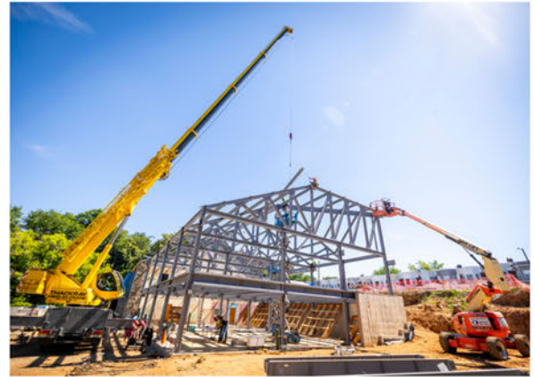
Construction underway at the Johnny Sample Recreation Center

As the project lead for the Johnny Sample Recreation Center and Cobbs Creek Environmental Center Rebuild project, the Conservancy's Capital Projects team managed construction at the two properties in 2024. In the spring, construction wrapped up at the Environmental Center, which included HVAC system upgrades, a replaced roof, safety infrastructure and lighting, and new amenities such as custom millwork and new reception area furniture. Additionally, the Conservancy worked with three PowerCorpsPHL crews to plant 240 bare-root trees and shrubs along the Cobbs Recreation trail located behind the Environmental Center.