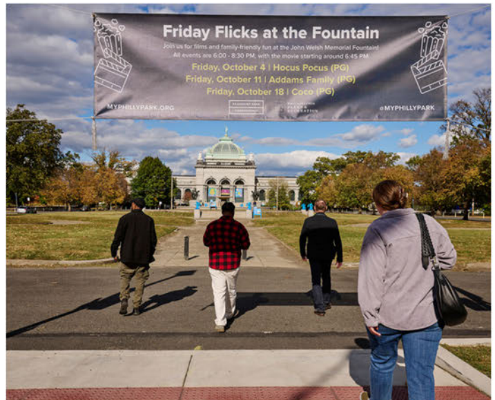
Civic Commons Studio Walking Tours