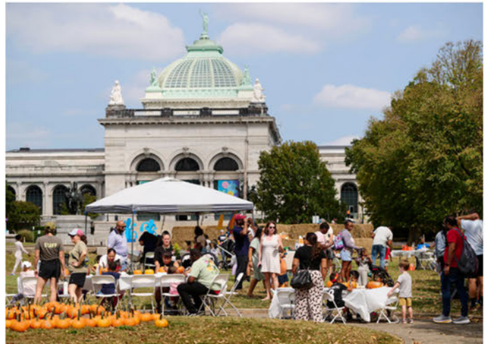
West Park Harvest Festival