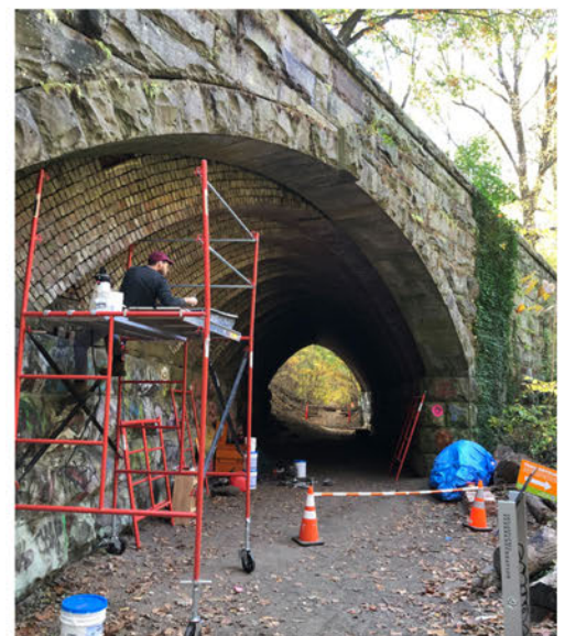
Skew Arch Bridge restoration work along the Trolley Trail

The Conservancy engaged a subcontractor to construct three additional trailheads to the Trolley Trail – an improved trailhead at the Chamounix Mansion entrance with an accessible gravel path and bike rack, a new trailhead at Ford Road, and a third at the base of Belmont Plateau – which was completed by October. In the fall, the Conservancy’s historic preservation team implemented stabilization repairs to the Skew Arch Bridge along the Trolley Trail nearest to the trailhead at Chamounix Mansion, worked with volunteers to remove vegetation overgrowth from the bridge surface structure and granite abutments, and completed brick replacement repair and pointing at the Skew Arch Bridge through October and November.