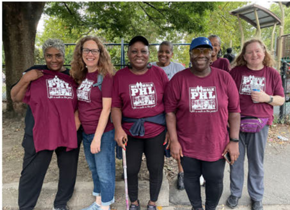
We Walk PHL, Wharton Square

In April, the Conservancy celebrated the graduation of 11 volunteer leaders from our Volunteer Leadership Program. These dedicated individuals in the 2024 volunteer leader cohort attended weekly trainings throughout March, led by our Volunteer Program Manager. The weekly training sessions taught the leaders about the Conservancy's mission and the multitude of programs we manage, and provided skill-sharing opportunities including CPR training. The Volunteer Leaders served as representatives for the Conservancy throughout the year, bringing additional capacity and energy to our critical work creating high-quality, equitable green spaces citywide.