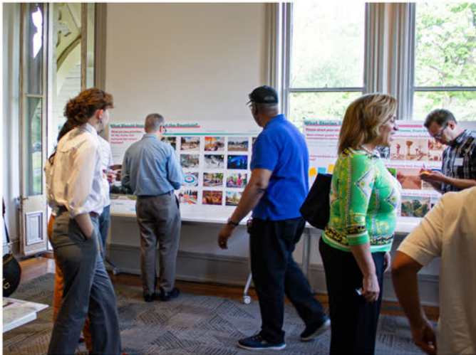
Community engagement for the Centennial Gateway at Welsh Fountain project

The design team for the Welsh Fountain Gardens project completed the design development phase, advancing the project design to incorporate community feedback gathered at the outreach events. Community interests and feedback for the Welsh Fountain landscape included interactive water/play features for families, intergenerational spaces, artwork, and temporary activation and event space.