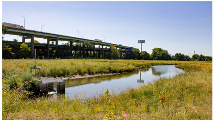
Tidal wetland created by PHL Airport