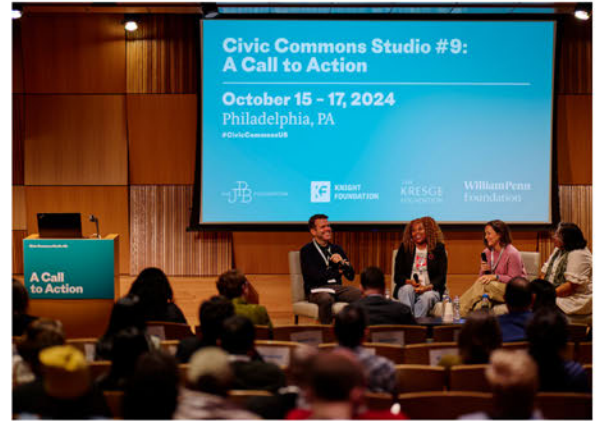
Civic Commons Studio #9 Speaking Program

In October, Philadelphia hosted the ninth Reimagining the Civic Commons Studio, an immersive conference that welcomed more than 100 public space practitioners from across the U.S. to tour Philadelphia and share ideas. The Conservancy was proud to serve as the local convener of this conference, organizing visits to our core park geographies and participating in several tours and speaking programs.