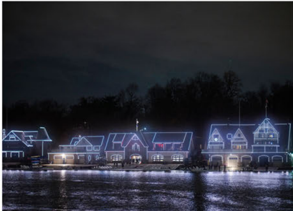
Boathouse Row relighting ceremony

As part of the renovation, the construction team finished demolishing the old building addition, which will be rebuilt and upgraded with new multipurpose spaces, a new lobby, and a new flex space designed for boxing and other new and existing athletic programs. In the spring, construction crews began laying the foundation, constructing the retaining wall for the new building addition, and re-grading the site for the new outdoor gathering space. By the fall, the construction team had completed building the steel structure and pouring concrete slabs for flooring, creating the "bones" of the new building addition. The team installed the concrete masonry walls for the building addition and removed the old roof from the gym building to prepare for the new roof installation which occurred over the fall months.