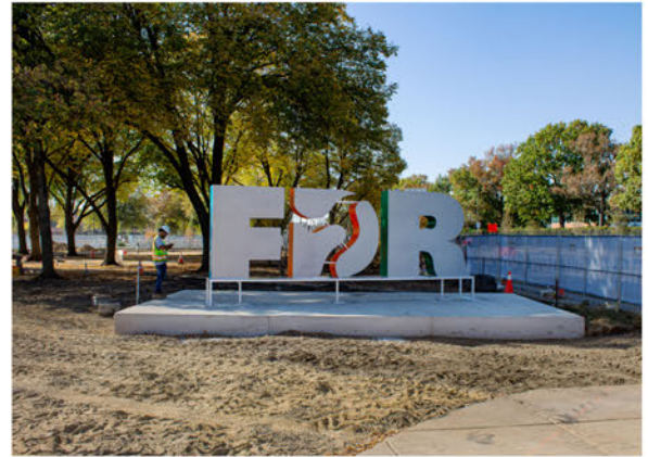
FDR Gateway Plaza sign installation

As part of the Gateway Phase at FDR, the Conservancy broke ground on the $6 million Gateway Plaza in April, with 2024 improvements including: 81 new native trees, 25 new shrubs, and over 12,000 perennial and grass/fern plugs planted as well as construction of rain gardens featuring native plants and flowering understory canopy to absorb stormwater and new plazas formed in the shapes of the park’s iconic lakes. In November, we celebrated a significant project milestone with the installation of custom-made park signage in the form of 6’6” steel letters spelling out “FDR.”