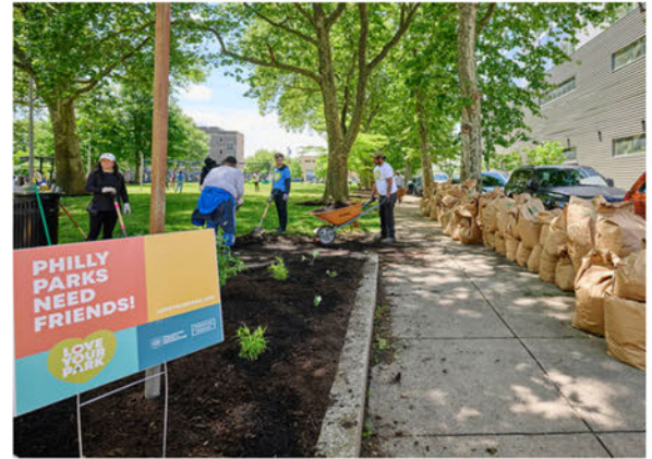
Love Your Park Spring

Launched in 2012, Love Your Park takes place in the spring and fall as a city-wide cleanup and celebration of public parks throughout Philadelphia. In 2024, the Conservancy, Parks & Rec, and Park Friends Groups hosted Love Your Park Week from May 11 to 19, inviting residents citywide to join in the care and stewardship of their neighborhood parks. Over 1,400 volunteers took action across Philadelphia to clean up and care for 110 participating parks. Volunteer crews collected 939 bags of trash, composted 1,228 bags of leaves, and planted 141 trees and 459 shrubs and flower bulbs! Stinger Square in South Philadelphia hosted the signature project for Love Your Park Week. More than 100 volunteers and PowerCorpsPHL corps members joined the Conservancy, Parks & Rec, and the Friends of Stinger Square to help prepare the park for the busy spring and summer seasons by planting trees and flower bulbs, raking leaves, mulching, sweeping, and picking up trash.