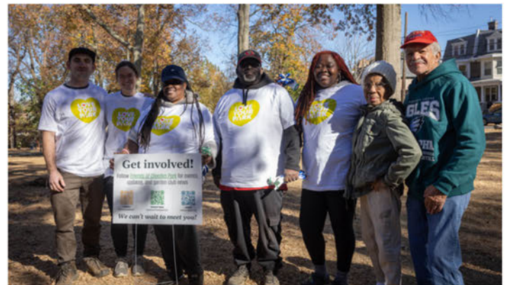
Love Your Park Fall Signature Site at Cliveden Park