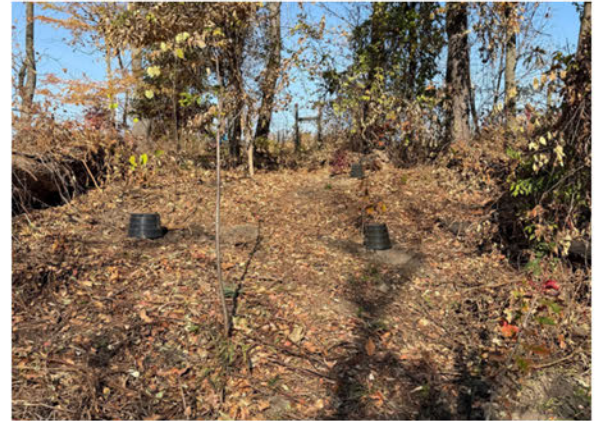
Haddington Woods Reforestation

The Conservancy and Philadelphia Park & Recreation work in partnership to manage, maintain, and restore hundreds of park acres on an annual basis. The Natural Lands team members have been conducting reforestation tree plantings and managing invasive species at 24 sites in Cobbs Creek, West Fairmount Park, East Fairmount Park, and FDR Park. The team also continued to strengthen its partnership with PowerCorpsPHL, providing training and education opportunities on natural lands stewardship, tree care, and urban forestry practices. In total, the Natural Lands team planted over 2,200 trees and 1,400 shrubs this year.