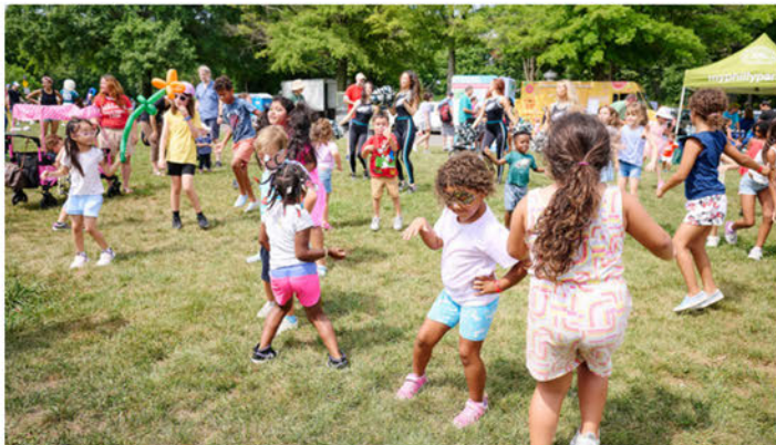
Family Field Day at FDR

After planting 7,000 trees and 1,700 bushes and woody shrubs in fall 2023, the park’s new 33-acre tidal wetland experienced its first full spring and summer of growth in 2024, showcasing a rich, diverse ecosystem and creating new habitat for a variety of native bird, mammal and fish species. The tidal wetland is the first project to be completed in the Nature Phase of the FDR Park Plan. In 2024, the Conservancy continued to work with the design team on other projects in the Nature Phase, completing a 2-acre emergent wetland and developing the site designs and coordinating with regulatory agencies to streamline permitting and approvals in the coming year.