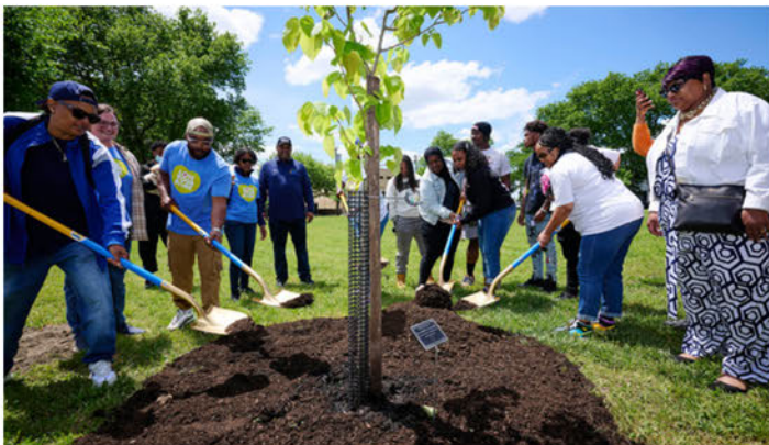
Love Your Park Spring Signature Site at Stinger Square

Each year, the Conservancy and Parks & Rec also provide support to the Park Friends Network (PFN) representing 141 neighborhood parks and community gardens through quarterly meetings, skills workshops, equipment loans, and small grants for physical improvements and special events. In 2024, the Park Stewardship team hosted four Park Friends Group meetings, engaging an average of 67 park friends per meeting, led four interactive workshops on topics such as fundraising, tree convening, grass and lawn care, and the city budget, and increased PFN social gatherings by hosting four Park Friends Meetups at various Parks on Tap locations throughout the summer and fall. The Conservancy awarded $67,500 to 87 Park Friends Groups to support small-scale park improvements and host 38 outdoor movie nights.