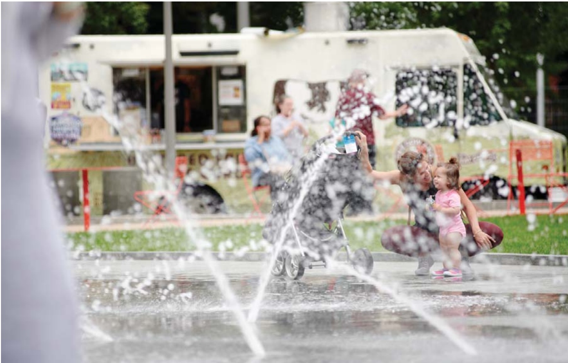
LOVE Park fountain, 2018

For the design of a LOVE Park children's activity book