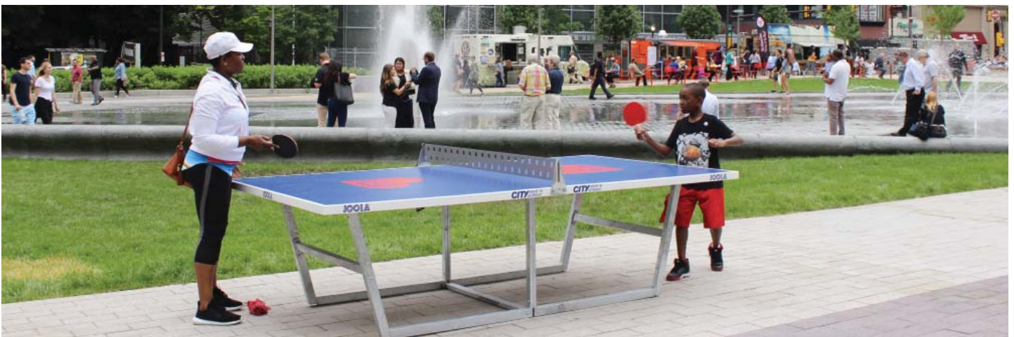
LOVE Park ping-pong table, 2018

For questions concerning this open call, please email arts@myphillypark.org .