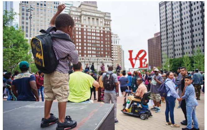
LOVE Park, 2018

The Arts & Culture Program is an initiative of Fairmount Park Conservancy, made possible with support from ArtPlace America. Using creative placemaking strategies, we seek to enrich parks and their communities, and to sustain a vibrant civic realm in Philadelphia.