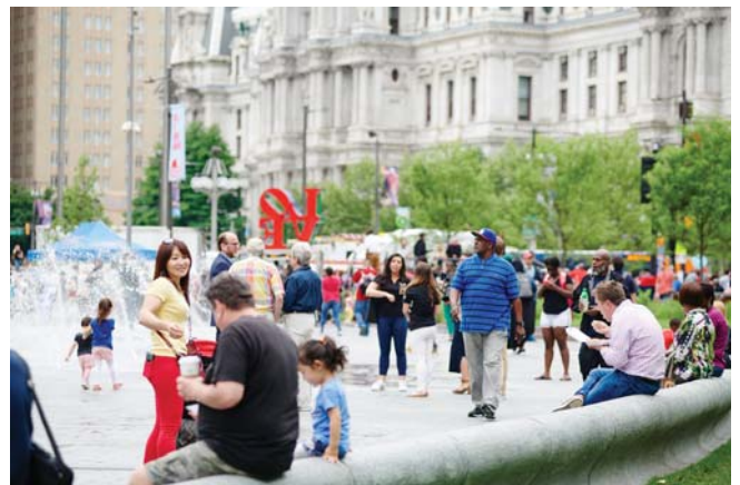
LOVE Park, 2018